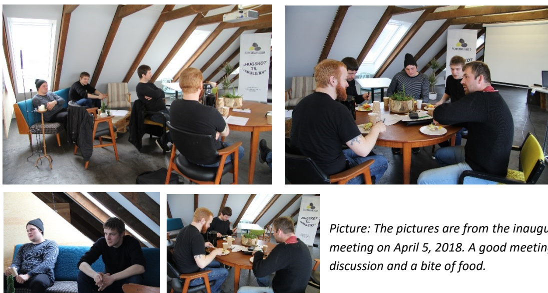
Picture: The pictures are from the inaugural meeting on April 5, 2018. A good meeting, good discussion and a bite of food.

https://www.facebook.com/economuseeforoyar/