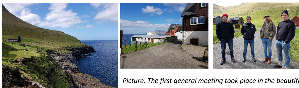
Picture: The first general meeting took place in the beautiful surroundings of Trøllanes